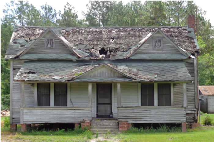
Central Hallway Dwelling - c.1910