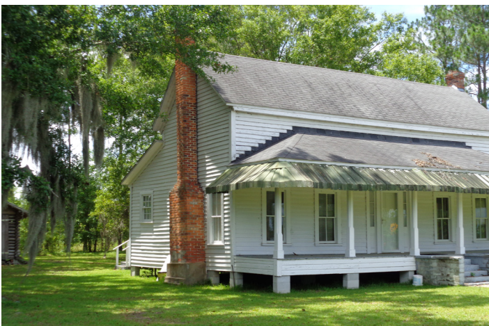
Side-Gabled, Central Hallway Dwelling - c.1900