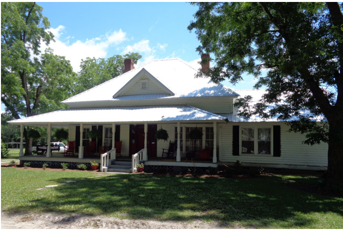
Georgian Cottage - c.1900