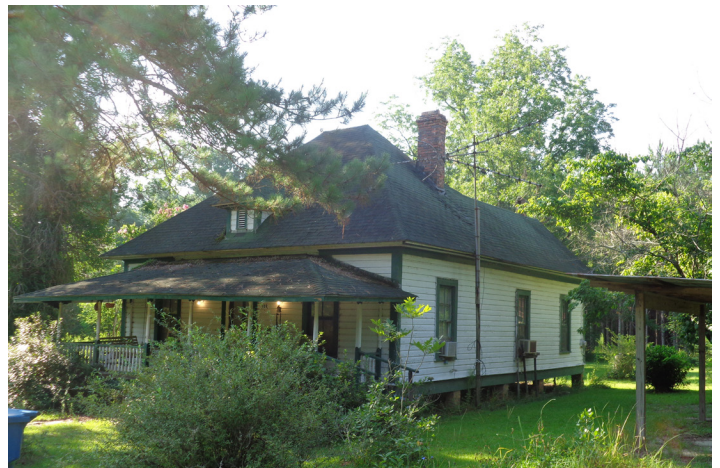
Georgian Cottage - c.1900