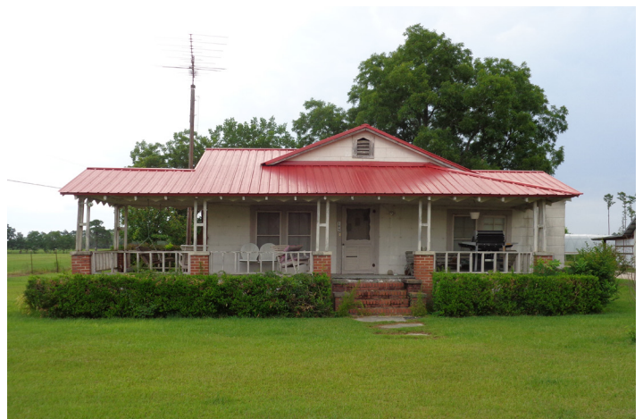
Side-Gabled Bungalow - c.1930