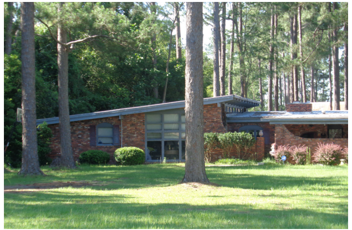
Rambling Ranch House - c.1960