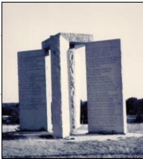
The Georgia Guidestones, site of the first 1998 EECP Philosopher's Walk.