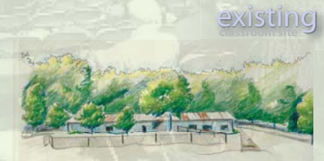
existing classroom site

The function of the chain link fencing is no longer necessary. Instead, the fencing interrupts the flow of the landscapes and gives park visitors a sense of unnecessary boundaries. Fences around the former playground, tennis courts, and along Stripling Chapel Road should be the first fences removed. Flexibility exists in making decisions about whether to keep or remove fences that border on adjacent neighborhoods. However, eliminating fencing is needed in order to remove visual impediments. Likewise, the realignment of the road provides the opportunity to bury the power lines on Stripling Chapel Road. This will help provide a visually uninterrupted scenic landscape.