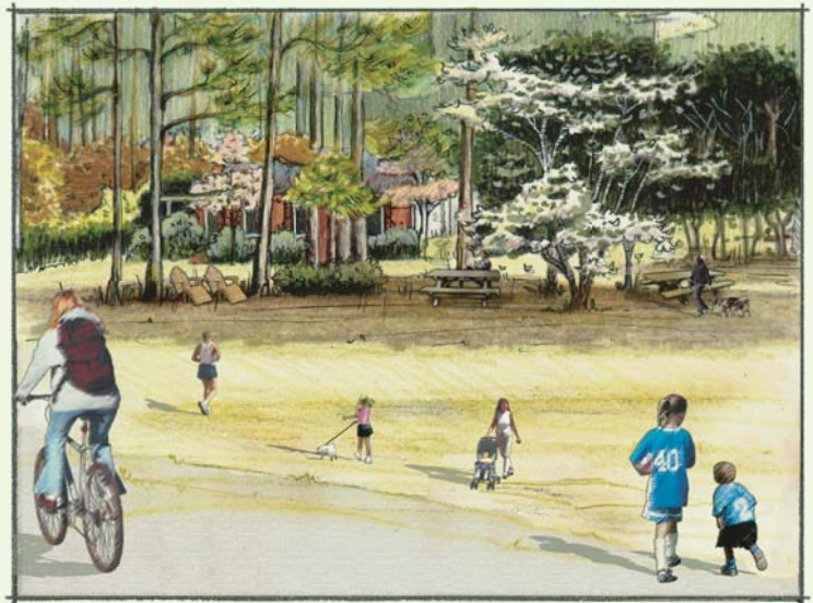
The area around the Folds cottage would make an appealing picnic space with shady spots under the pine trees and dogwoods and an open lawn for enjoying the sun.

The house, the cottage and the historic formal planted grounds surrounding them are an excellent contrast to the open, rolling hills and peripheral forests of the Park. The House will surely be a showplace for many community events. With good management of the House, it can serve for community non-profit offices as well as rental facilities for weddings, reunions, fundraisers and other social events.