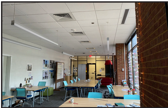
View of Caldwell G14

At the beginning of this year, the students of the MHP program moved across the breezeway into G14 Caldwell. This new lounge area is equipped with desks and lockers for each student as well as computers featuring the latest programs and software. In this space, students are able to gather, study, and socialize with one another.