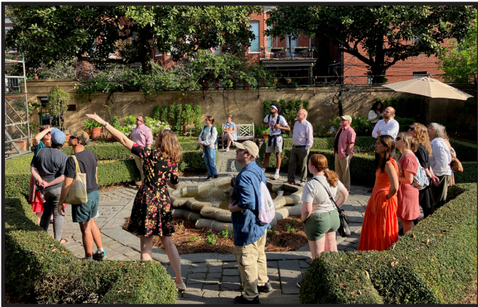
Students outside of the Owens-Thomas House & Slave Quarters