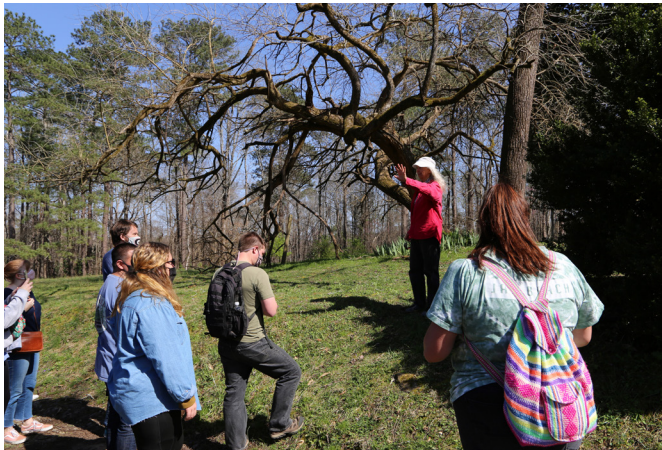
Hyde Farm is a historic agricultural site managed by the National Park Service and Cobb County Parks Department. A long-time resident explains to HP students how the Hydes used the historic cultural landscape.