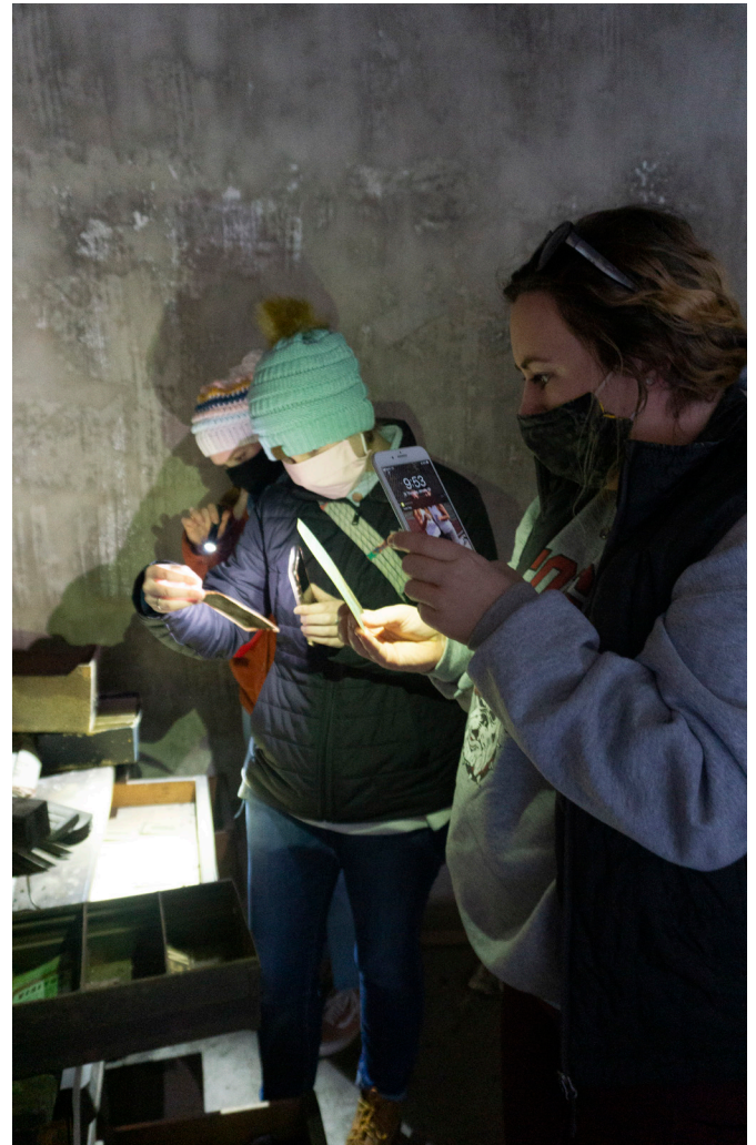
HP students explore the Westview Cemetery Gatehouse. Landmark Preservation, a historic preservation consultant firm, is conducting a historic resource assessment of the structure.