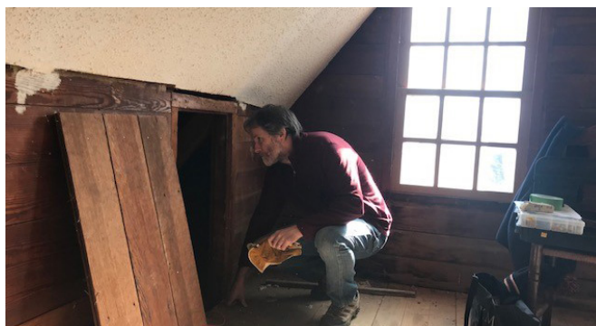
Photo from the Bowdre-Rees-Knox House in the historic Wrightsboro Settlement, a Georgia backcountry house that was dated via dendrochronology.

Read more about the project here and consider supporting this vital campus resource here .